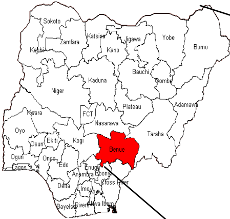
Figure 1: Map of Nigeria Showing Benue State Colored in red