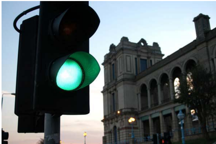
Fig 2.7 Traffic control light

and makes sure that there is enough space between platoons. In order to optimize flow, a platoon leader receives information about the optimal speed from a roadside coordinating system. Because of this, and the fact that there is little distance in between cars in a platoon, an AHS is said to be able to increase road capacity by a factor of about four. Another aspect of traffic control is controlling traffic lights in a way that minimizes the time drivers have to wait. We will describe previous research in this area and our car-based, multi-agent reinforcement learning algorithm in section 4. First we will discuss reinforcement learning (Huan and Miller, 2011).