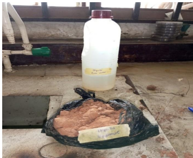
Fig. 2: Water sample and sediment of Ikpoba river

sampling bottles (plastic bottle or container) were used in collecting the river water. At each sampling point, sampling bottles were firstly rinsed with the river water, filled with the river water at a depth of 20 cm to 30 cm and later filtered through a Whatman no. 42 filter paper. The filtrate was then acidified with concentrated \text{HNO}_3 to make a pH of <2 and preserved at 4^\circ\text{C} in a refrigerator. Also, a sterile 2 cm diameter polyvinylchloride (PVC) tube was used to collect sediment samples from two points into pretreated sample bags and. All samples were labeled after collection and transported to the chemistry laboratory for further analysis.