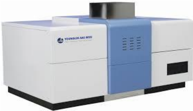
Figure 3: Atomic absorption spectroscopy

becomes light colored or clear. After digestion, the solution was allowed to cool to room temperature and filtered through a Whatman no. 42 filter paper into a 100 ml volumetric flask. It was then made up to the 100 ml mark with distilled water for the analysis of heavy metals (Cu, Pb, Fe, Zn and Cr) using the Atomic Absorption Spectrophotometer. The sediment samples were air-dried for twenty-one days, ground in porcelain mortar and sieved using a 2 mm sieve to reduce its size. About 2.0 g portion of dried sediment was taken in a 100 ml beaker and 15 ml of concentrated HNO 3 was added. The content was heated at 130 °C for 5 h until 2–3 ml remaining in the beaker, after which similar steps were followed as the water samples.