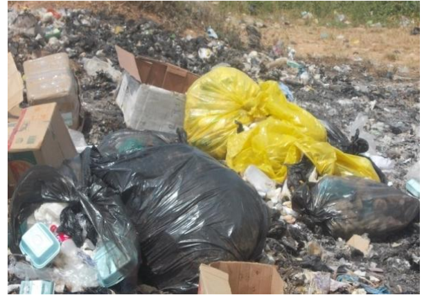
Plate VII: Colour coded plastic bags mixed up with different types of wastes in ABUTH Shika-Zaria

Ideally, the colour coded plastic bags were to contain different categories of wastes and not mixed up. The black plastic bag contains non-infectious wastes such as papers, packaging materials, bottles, cans; food remains etc. while the red plastic bag contains highly infectious wastes such as blood bag, extracted teeth, used test tubes and anatomical wastes e.g. placenta amongst other. The yellow bag contains infectious wastes such as dressing bandage, gauze, gloves and IV fluids lines etc.