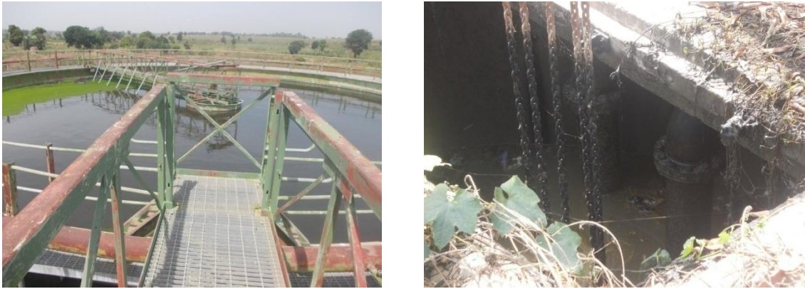
Plate I: Sewage disposal treatment plant site in ABUTH Shika-Zaria

In addition to the above the researcher made an observation on the sewage disposal sites during the course of the field work a photograph was taken as the researcher observe the sewage disposal treatment plant site.