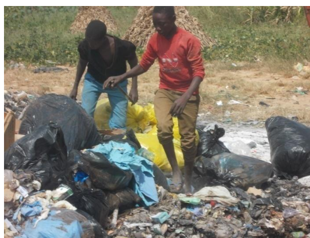
Plate XVI: Scavengers at the final wastes disposal site in ABUTH Shika-Zaria