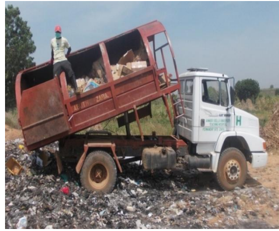
Plate XIII: Compacted wastes disposal vehicle disposing wastes at final disposal site in ABUTH Shika-Zaria

Observation revealed that ABUTH Zaria had only one functional compacted vehicle for transporting wastes to the final disposal, the compacted parts had broken away, living the vehicle almost open and which is dangerous to the health of workers.