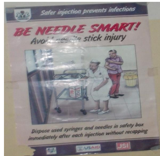
Plate III: Poster of sharp segregation