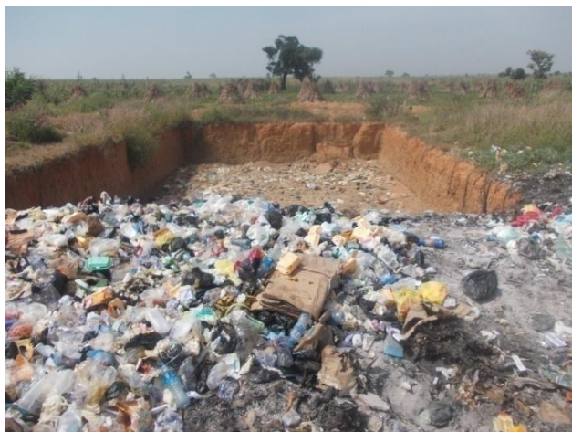
Plate XIV: Abandoned landfill in ABUTH Shika-Zaria

An observation was made to the site of the final method of wastes disposal and a picture is presented below.