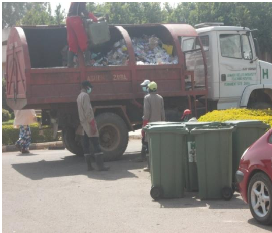
Plate XII: Transportation of wastes to final disposal site in ABUTH Shika-Zaria

The finding on Table 4.6.6 reveals that majority 172 (59%) of the respondents indicated that wastes are transported to the final disposal site with enclosed compaction vehicle while 75 (26%) of the respondents indicated that wastes are transported with open vehicle. This further reveals that the female gender had more knowledge on the transportation of wastes. In reality the vehicle use for wastes transport is a compacted vehicle but the compacted parts are broken away living the vehicle open, this could be the reason why few attested that it is an open vehicle. Photographs were taking in the course of observation.