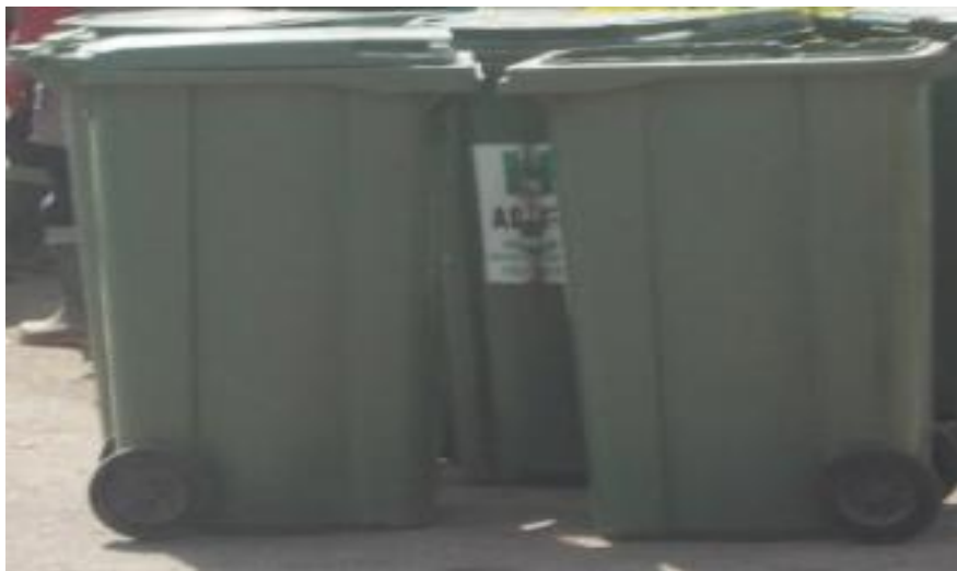
Plate V: Wastes containers without biohazard symbols in ABUTH Shika-Zaria

An observation was made and a photograph of wastes containers without symbols was taken.