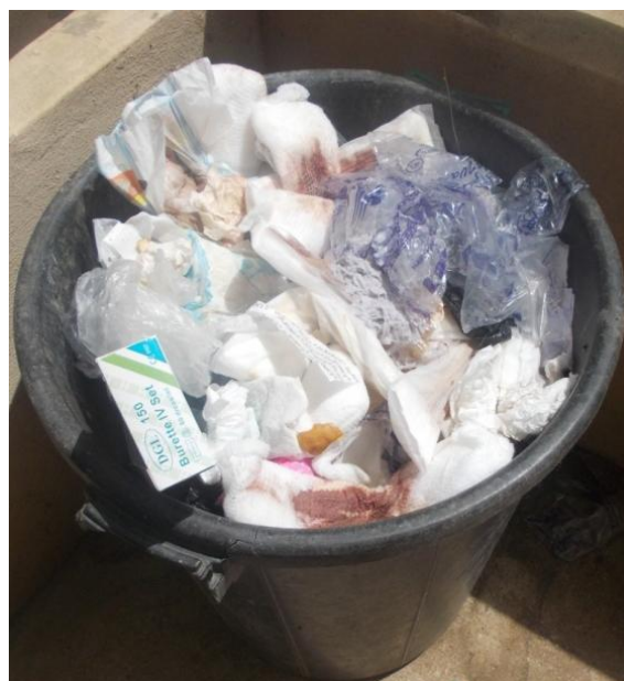
Plate IV: None segregated wastes in ABUTH Shika-Zaria