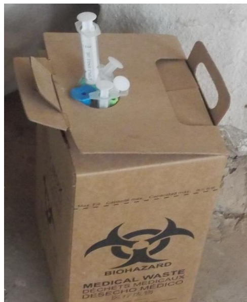
Plate VIII: Sharp box awaiting disposal in ABUTH Shika-Zaria

This was in line with the observation been made during the field study. Here is a photograph taken.