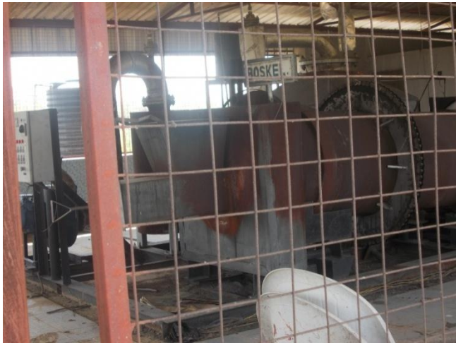
Plate X: Non-functional incinerator in ABUTH Shika-Zaria

An observation was made during the field study to the treatment site where the incinerator is located. A photograph was taken by the researcher in support of the statement.