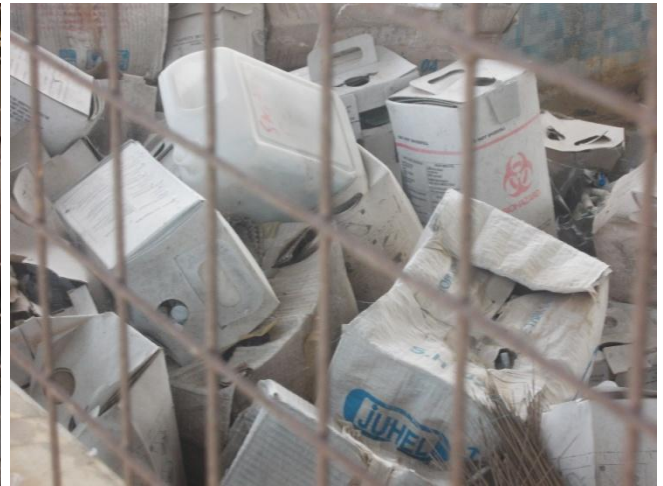
Plate XI: Sharps awaiting incineration in ABUTH Shika-Zaria

The observation reveals that, the incinerator plant is not functioning and sharps majorly needles were stored inside the incinerator plant as revealed in Plate X and XI.