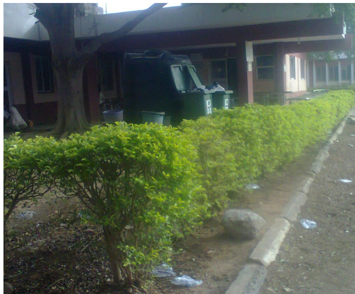
Plate IX: Wastes stored at the front of A & E Unit in ABUTH Shika-Zaria

An observation made during the field study, it was observed that wastes are normally stored in the front of the wards or at the front of the emergency ward as shown in plate IX below: