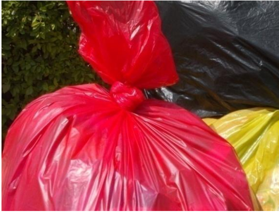
Plate VI: Colour coded plastic bags without symbols in ABUTH Shika-Zaria

During an observation at the waste disposal site, photographs were taken to affirm the interview above.