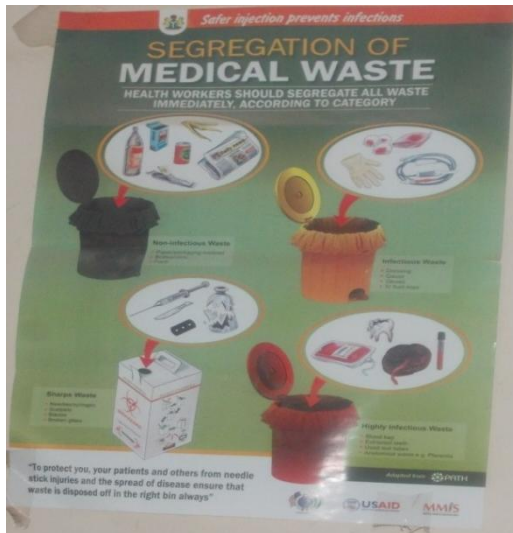
Plate II: Poster for different categories of segregation

From observation, it was revealed that, there are posters on segregation of wastes (see plate II) but it was observed that provision was only made for syringes to be segregated into sharp boxes (see plate III). This implies that wastes are segregated into types but not all categories of wastes receive enough attention as to where they should be deposited (see plate IV).